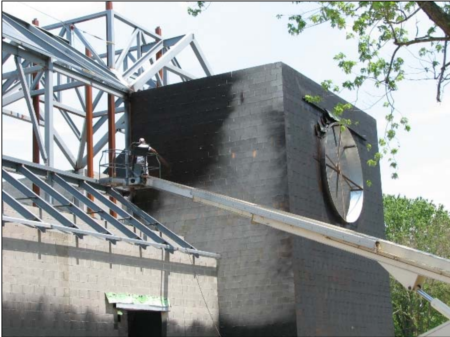
The Entire Chapel is Painted with a Moisture Resistant Barrier