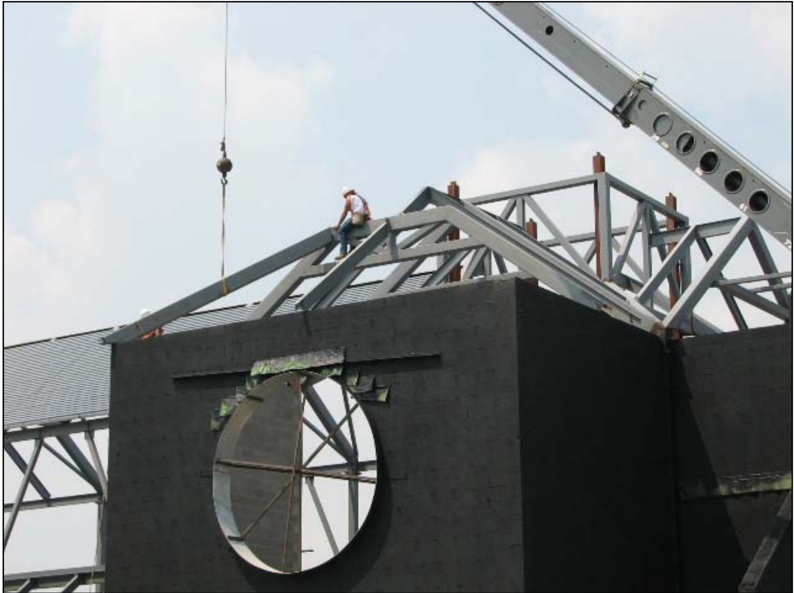
Workers Place Support Beams to Hold Roof