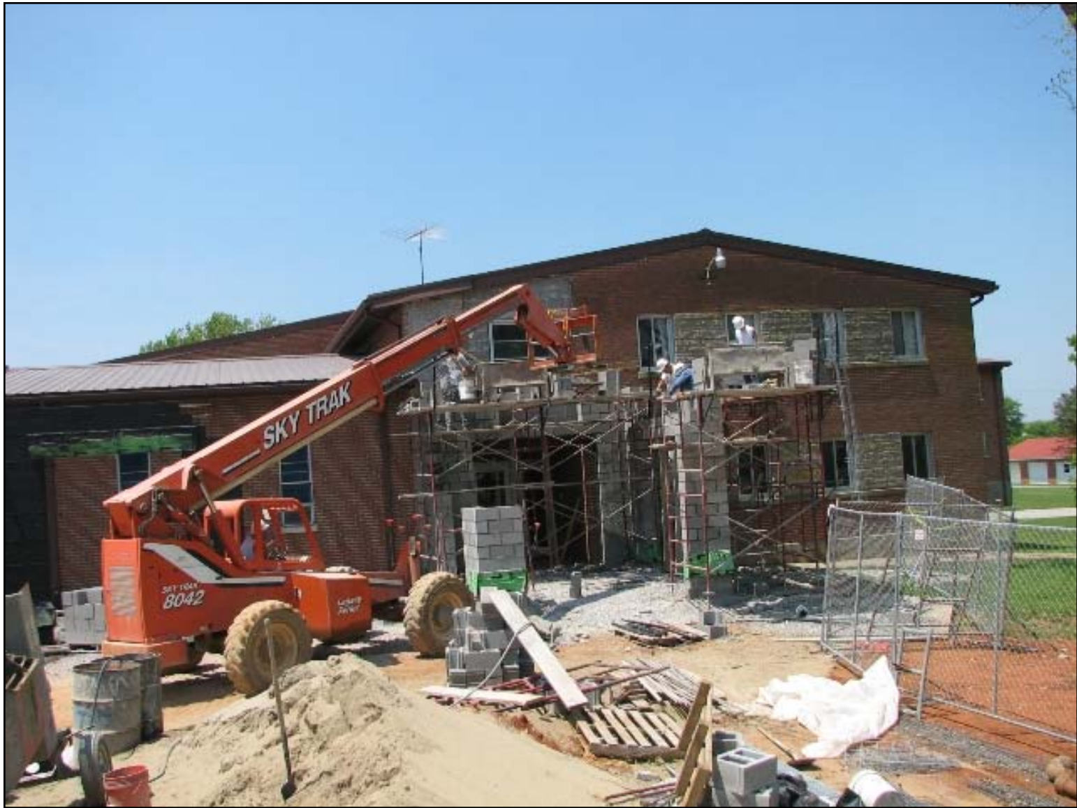
Tower Begins to Take Shape