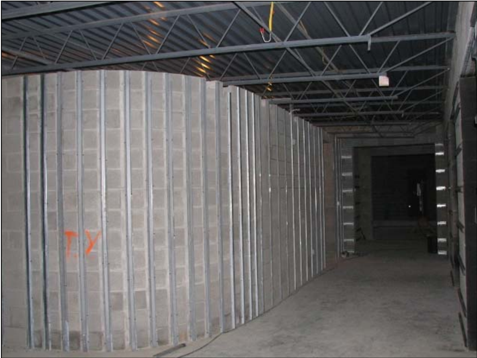
Corridor to Chapel - Aluminum Studs are Placed To Allow Sheet Rock to Be Hung