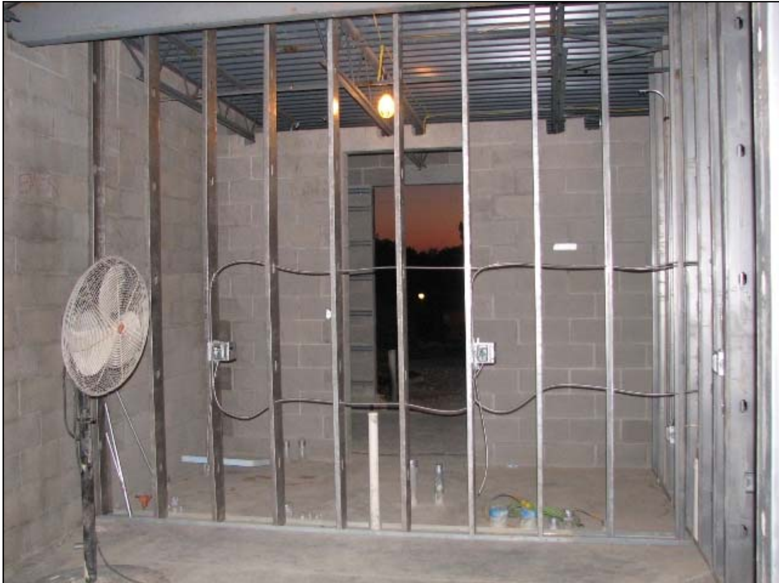
This Will Be the Main Electrical Room for the Chapel & Sacristy