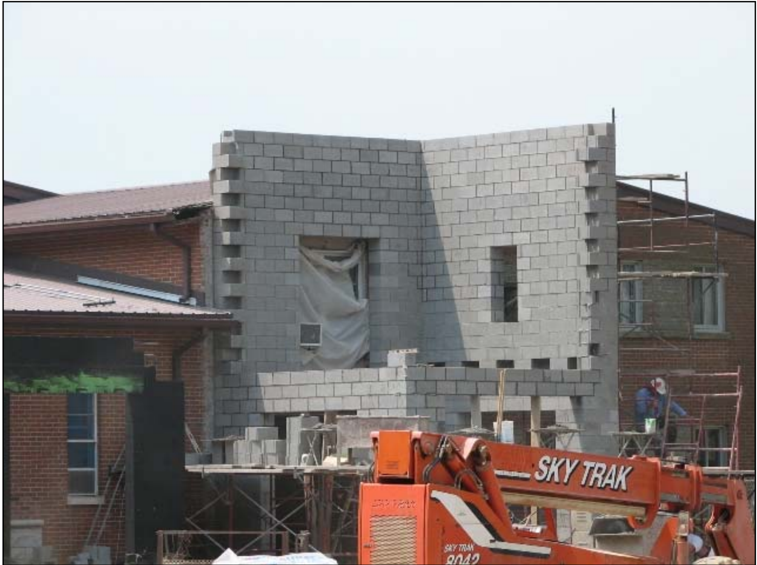
Another View of Tower