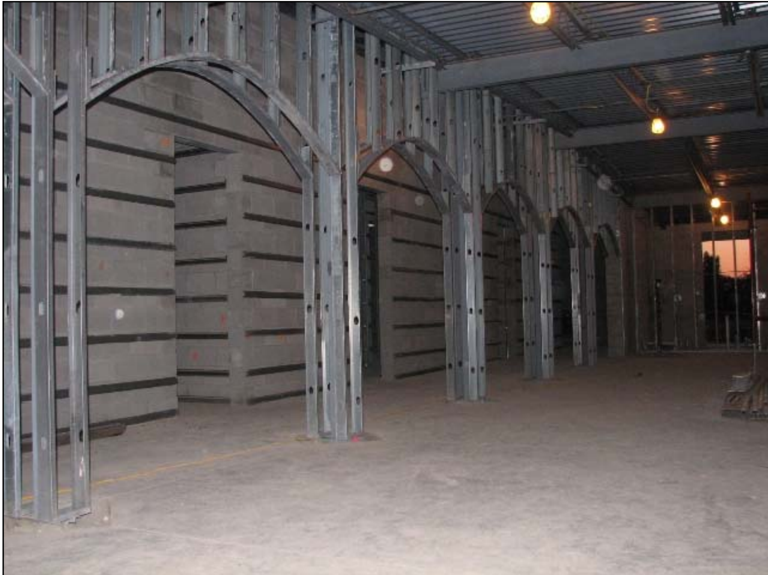
Archways Separate Priest Vesting Area From Walkway to Confessionals & Sanctuary