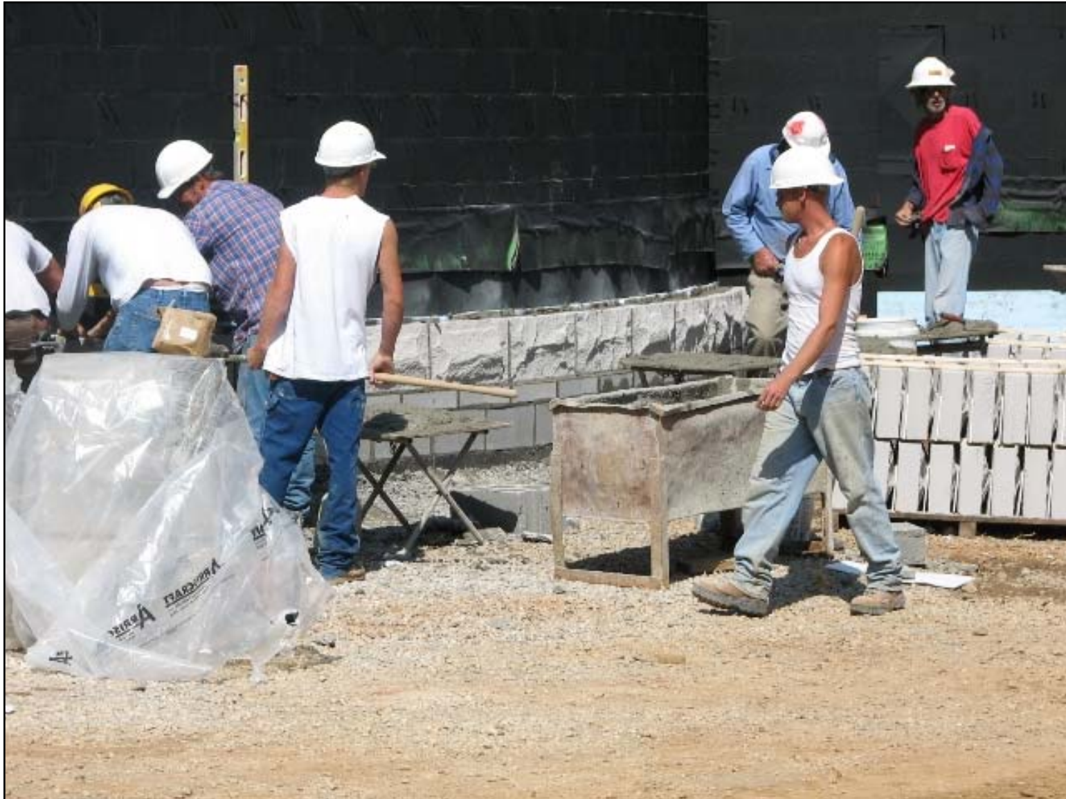
An Imitation Limestone Is Used Around Base of Chapel for Aesthetics and Longevity